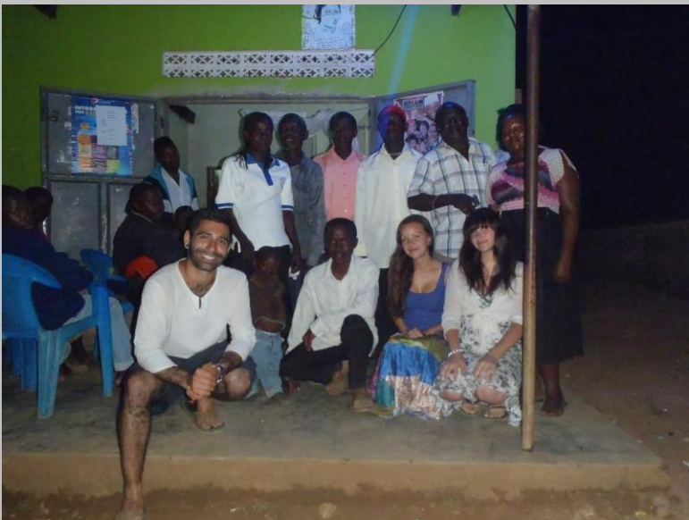
Volunteers with the members of the community.